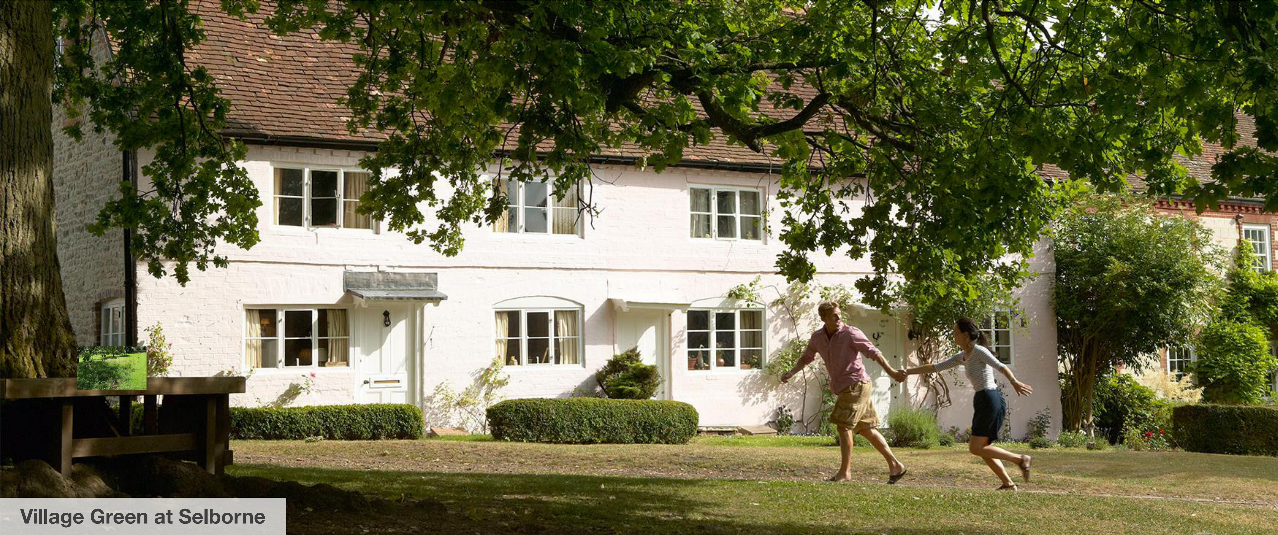
Village Green at Selborne

The creation of an accessible green at the heart of the village will deliver a tranquil environment for enjoyment by all Steep residents. It will provide a focus for the development and promote neighbourliness and social inclusion.