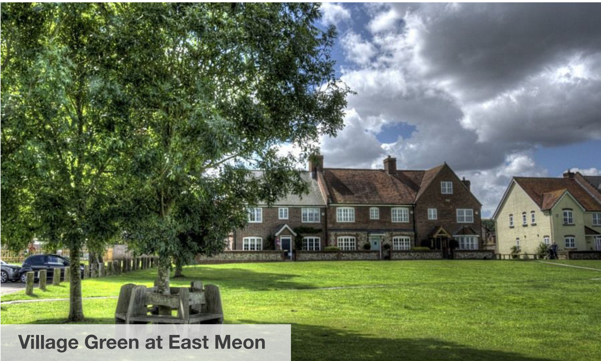
Village Green at East Meon

Wilson Designer Homes has been asked by the Village Hall trustees to assist in the preparation of design illustrations to aid separate deliberations on this possibility.